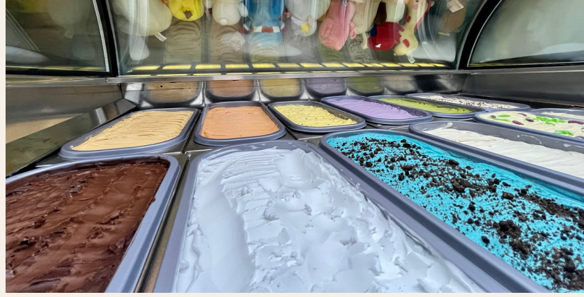
HEARTBREAK MELT'S GELATO